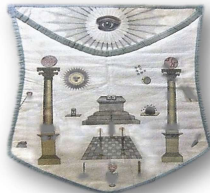
The Lafayette Apron