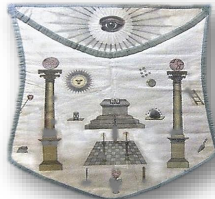
The Lafayette Apron