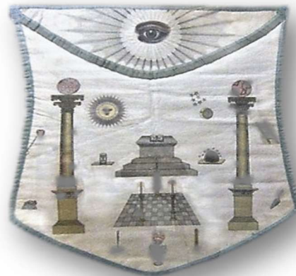
The Lafayette Apron