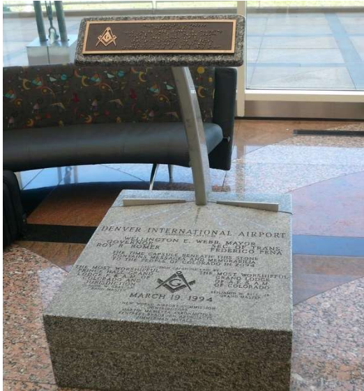
Masonic Capstone in Jeppeson Terminal