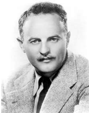
Bro. Darryl F. Zanuck

Bro. Darryl Francis Zanuck was born on September 5 th , 1902.