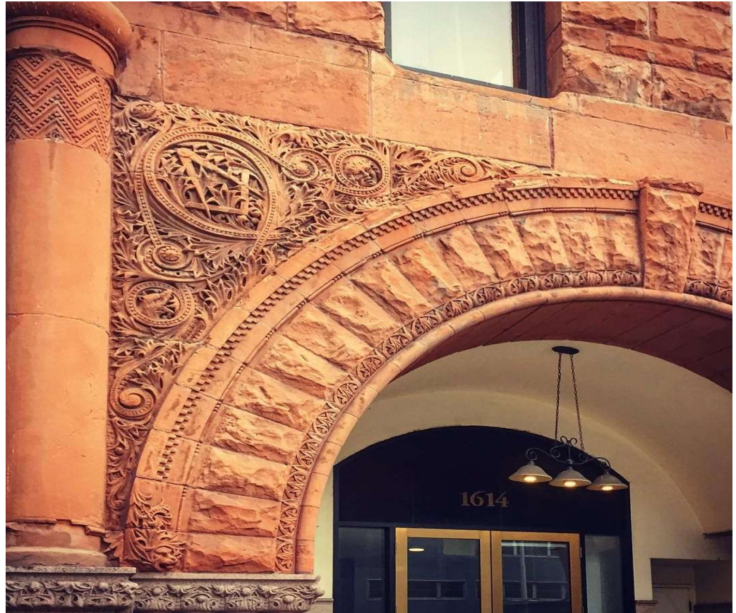
Our home, the historic Masonic building at 1614 Welton Street in downtown Denver